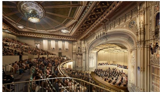
Renderings of the Copley Symphony Hall